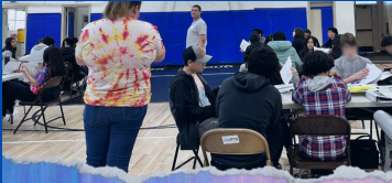
YEIP- CAMP COUNSELING